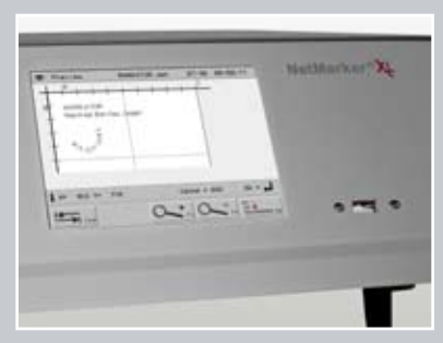
Large Colour LC Display and USB-slot on the front panel